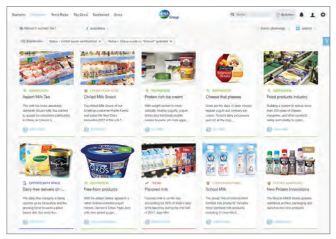
Figure 2: Display of results in ITONICS Radar

In order to select the right scouts in the network for the topic of nutrition and food trends , a screening takes place within the community. Therefor, scouts in the selected trend metropolises answer various questions on the topic and collect relevant trend information as examples. The best trend scouts are awarded a virtual badge and are then available to the DMK Group for this and future trend scouting studies .